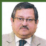
Secretary, DEPwD and Chairperson of the Board of the National Trust

Looking after a person with disability is always a challenge for the parents. It also hinders many parents from performing their daily work. Keeping this in view, the National Trust has made a Day Care Scheme, 'Vikaas'. The scheme, besides taking care of a PwD, will also provide Vocational and Skill Training and enable him to work in work centres for development of products.