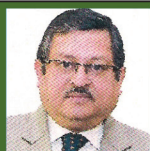
Secretary, DEPwD and Chairperson of the Board of the National Trust

For Early Intervention and School Readiness programme a new scheme 'Disha' has been formulated by the National Trust. It will definitely help persons with disability in the 0-10 years age group in improving their condition and preparing them for school. The parents will also be benefitted by getting training in day-to-day management of their child.