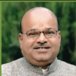
Hon'ble Minister of Social Justice & Empowerment

Generally, it has been observed that parents are not aware about proper upbringing of children in the age group of 0-10 yrs having disabilities catered by the NT. Parents are also not aware about how to take care, train and prepare them for school. Disha scheme shall be very useful in this regard.