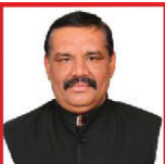
Hon'ble Minister of State for Social Justice & Empowerment

Disabled children find it difficult to get admission in any institution of learning due to various impairment from birth. Hence, need intervention and training to take care of their daily activities and self care. This training is given to them through Disha, as an early intervention & school readiness programme. This early intervention programme is available for the children of age group of 0-10 yrs.